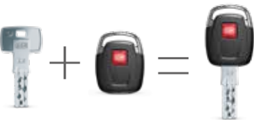
Two systems, one key.

any and all DOM mechanical keys – you can expand our feature-rich digital experience to all your locks. Unify your mechanical and digital systems with ENiQ and unlock endless possibilities – your Digital Security Ecosystem by DOM.